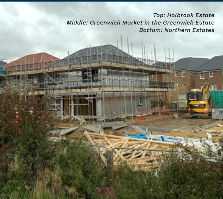
Top: Holbrook Estate Middle: Greenwich Market in the Greenwich Estate Bottom: Northern Estates